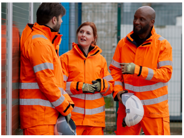
Ultra lightweight and breathable